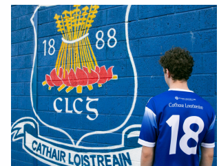
Caherlistrane GAA Club jerseys featuring the Tuam Cancer Care logo, sponsored by Queallys Bar