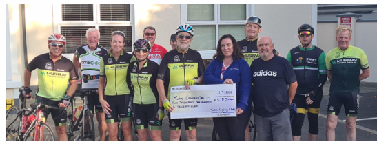
Tuam Cycling Club, Annual Charity Cycle

Thank you to everyone that has supported us over the last couple of years, these are some events that have taken place