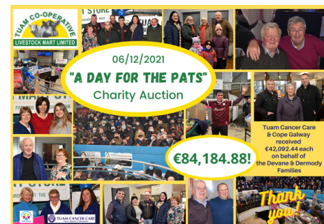
A Day for the Pats at Tuam Mart