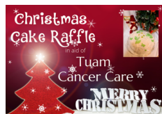
Christmas Cake Raffle