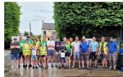
O'Connors Fuels Charity Carwash